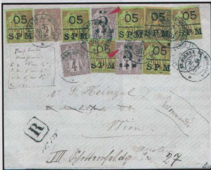
Figure 4a. 1889 COVER SENT TO VIENNA, CAPITAL OF AUSTRIA-HUNGARY DURING THIS PERIOD. Three things make this cover interesting - its destination, mixed postage 'colonie générale - SPM' and the presence of two stamps with this unreported 'Five' overprint. Probably the finest cover of the 'SPM' classics.

wiped out the archive department and many documents were damaged or destroyed. It is therefore not possible to confirm whether it was also issued in 1885. It should be noted that several issues and reprints were made in December, 1885. It is also highly likely that this stamp came into being at the end of the year.