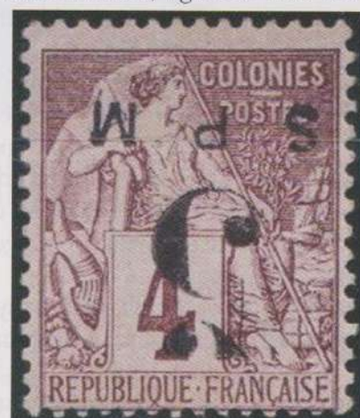
Figure 2. Inverted overprint. Mint. Only known example.

In 1998, I found another new example at an auction, which also had an inverted 'Five,' but with the 'SPM' triple overprinted, which was also inverted, figure 3. This item was sold as a variety of the number four and is another exceptional find. The only slight disappointment is that it is thin in areas and a tooth is missing from the upper left-hand corner.