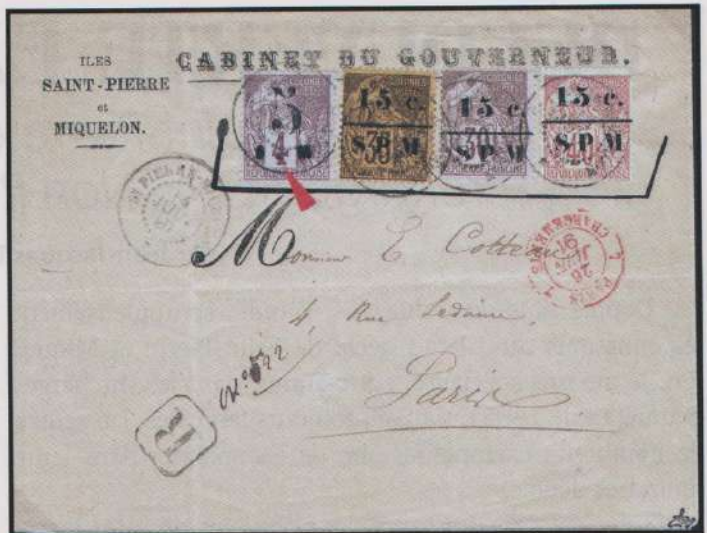
Figure 5. 1891 COVER SENT TO PARIS BY THE GOVERNMENT. This letterhead is even better evidence of the official issue of this unreported overprint. There was a delay before it came into use. On this example, the letter 'P' in 'SPM' is not printed. Exceptional cover of major interest.

Over 10 years have passed and no stamp had been discovered... until New York, 2016. In fact, while browsing the dealers' stalls at this fine international philatelic event, I stumbled on another example, which was cancelled but isolated. This example, which is heavily inked and misses two teeth, is dated 1888, figure 6.