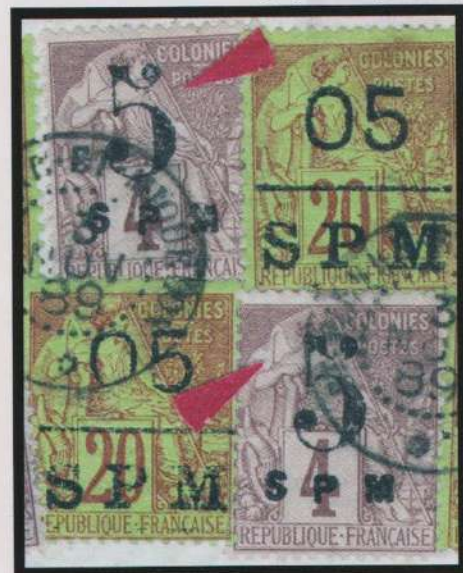
Figure 4b. Enlarged copy of the 1891 cover showing the two stamps.

No text in the available archives mentions a different 'Five' stamp. A fire