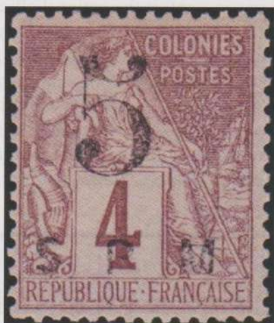
Figure 1. Normal.

All collectors of classics from St-Pierre et Miquelon know about the five over four cent lilac-brown on grey from 1885 ( Yvert/Maury #4 - Scott #10 , figure 1). This stamp was issued in March 1885, with two overprints in black printed separately - the 'Five' and the 'SPM.'