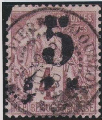
Figure 6. Cancelled in 1888. The number 'Five' is heavily inked. Only known detached stamp.

Further mystery surrounds the 'SPM' overprints on examples cancelled with the local overprint, which are closer together than the inverted overprints on the mint stamps. This leads us to believe that there were two different print runs. On one of these stamps, the letter 'P' is missing from 'SPM.' This variety adds additional interest. This unreported overprint, as it is known, is therefore a major rarity from the French colonies.