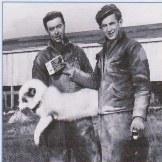
A fox in the arms of the breeder (1950).

The purpose of this study : to show the the two values issued on October 10, 1952 , 8 franc and 17 franc denominations. They were important because they corresponded to the first St. Pierre and Miquelon values issued for "Air Mail " rates to France and abroad subsequent to the start of an air link from the Islands.